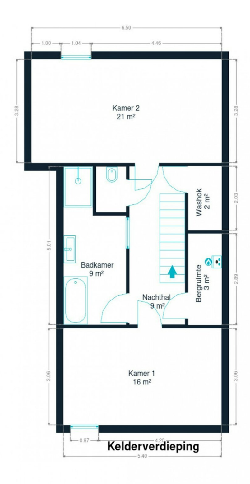
Plannen zijn louter informatief en niet contractueel.

Little tip: measurements are not always 100% perfect. A margin of error should be taken into account. So, before puzzling over your favorite wardrobe, apply a safety margin!